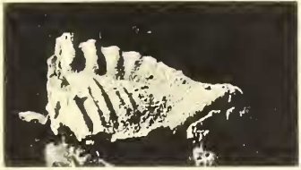
3 x 4.5